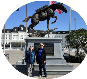
World Equestrian Center In Ocala