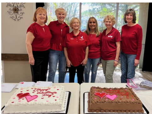
On Valentine's Day these ladies in red from VFWA 7909 and MOCA Catfish 23 hosted a party at Oak View Nursing Home providing cake, fruit, and handmade cards.