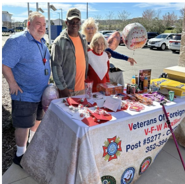
Auxiliary 5277 handed out Valentines, donuts, juice, water and candy at Clermont VA Clinic