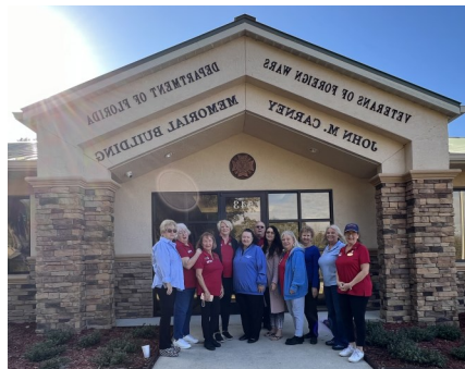
At VFW Headquarters in Ocala