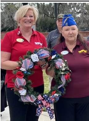
Laying wreath at Veterans Memorial Park in Ocala