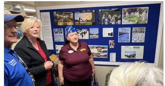
Touring the Veterans Museum in Ocala