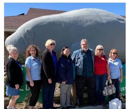
Viewing manatees at Homosassa Wildlife Preserve